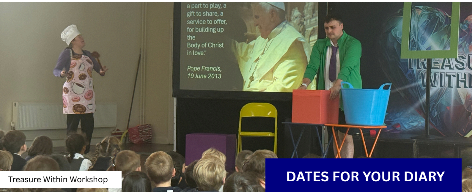
Treasure Within Workshop

'Achieving our best by learning together and serving one another with Christ by our side'