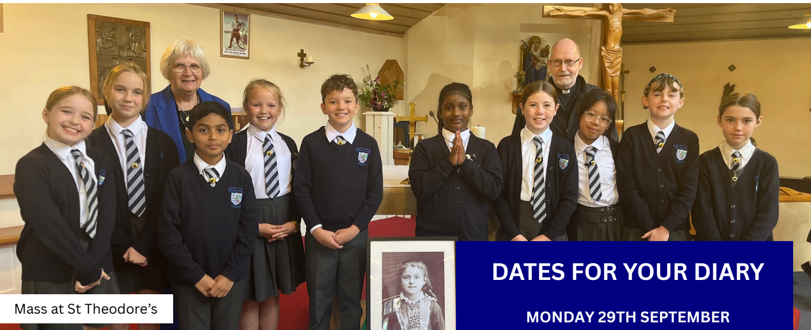
Mass at St Theodore's

'Achieving our best by learning together and serving one another with Christ by our side'