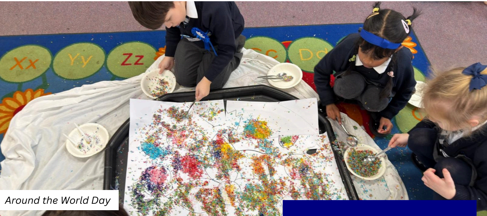
Around the World Day

'Achieving our best by learning together and serving one another with Christ by our side'