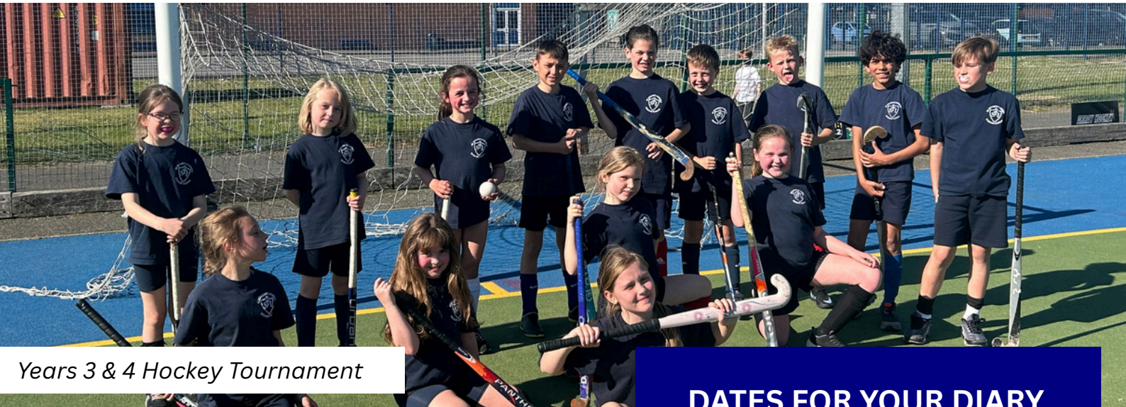
Years 3 & 4 Hockey Tournament

'Achieving our best by learning together and serving one another with Christ by our side'