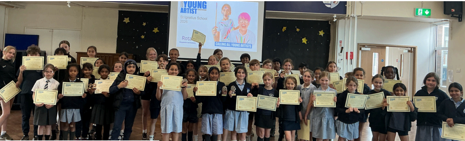
Rotary Young Artist Competition

'Achieving our best by learning together and serving one another with Christ by our side'